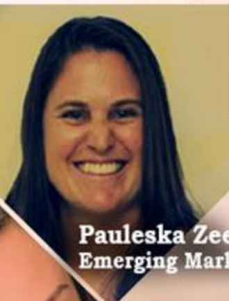
Pauleska Zee Emerging Markets