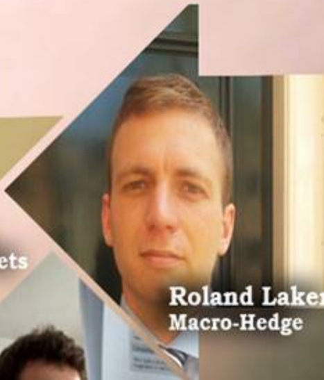
Roland Laken Macro-Hedge